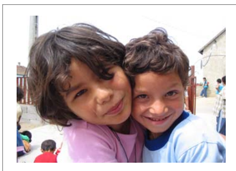
Having fun at the Backyard Bible Camp.

"Yes, Lord; Yes, Lord; Yes..." The words of the English chorus could be heard ringing through the villages along with the shouts of "Alleluia" and "Ald az Urat" (Hallelujah & Praise ye the Lord) as the boys and girls tried to outdo each other in the familiar chorus. Hands shot up eagerly as the village children volunteered to