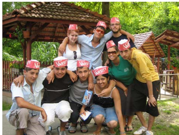
Learning the English vocabulary for restaurants—thanks to the famous Varsity in Atlanta for the hats!

English language learning can be lots of fun when combined with a hot dog cookout, a luau party, tug-of-war and many more fun activities. That's exactly what happened when a group of young people traveled from Haven Fellowship Church in Conyers, GA to a camp outside of Pecs, Hungary. The 30 English-learning students from Gandhi came by train to be greeted with shouts of welcome. The week centered on formal English classes with many informal activities as well. Highlights of the week were the opportunities to experience American cuisine, the talent show, and the four-square game challenges. One day was set aside for the Roma students to teach the American team about Romany culture. This day concluded with some of the Roma girls making a traditional Gypsy supper for all the campers. Many lessons were taught and learned during the week. The most important lesson being that God loves us each and everyone no matter your language or culture.