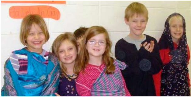
Children on Mission enjoy learning about medical missions in Southeast Asia. Other recent children's mission units include learning about FBC's partnership in Cuba and rural poverty in Kentucky.